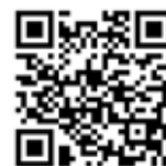
Game On QR code