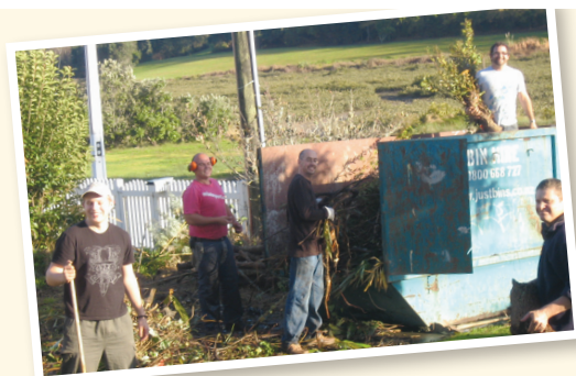
Harbourside Team 1:17 "Upholding the widows, defending the fatherless"

In two years, our Team 1:17 Men's Team Ministry has grown from 3 teams to 13. Each month around 60 men of all ages gather for breakfast, prayer and organising practical arrangements before visiting their "care receiver".