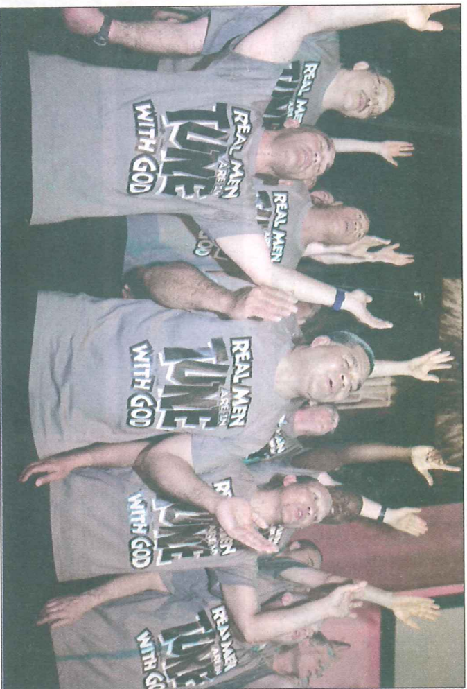
GETTING REAL: Fervent worship at Promise Keeper's Forging Tomorrow's Men event in Manukau recently.