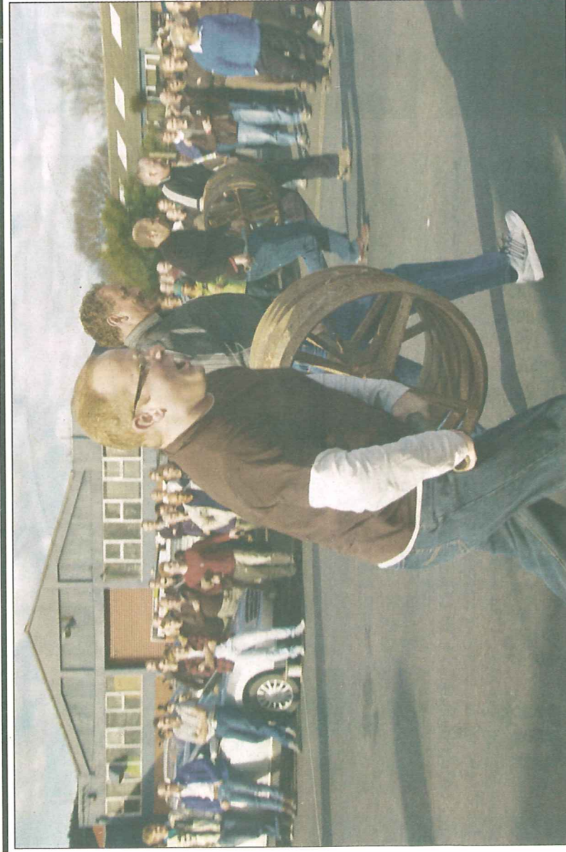
FIERCE COMPETITION: Some of the men were game enough to compete in a relay race.